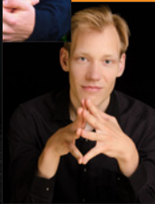
23rd May: Strictly